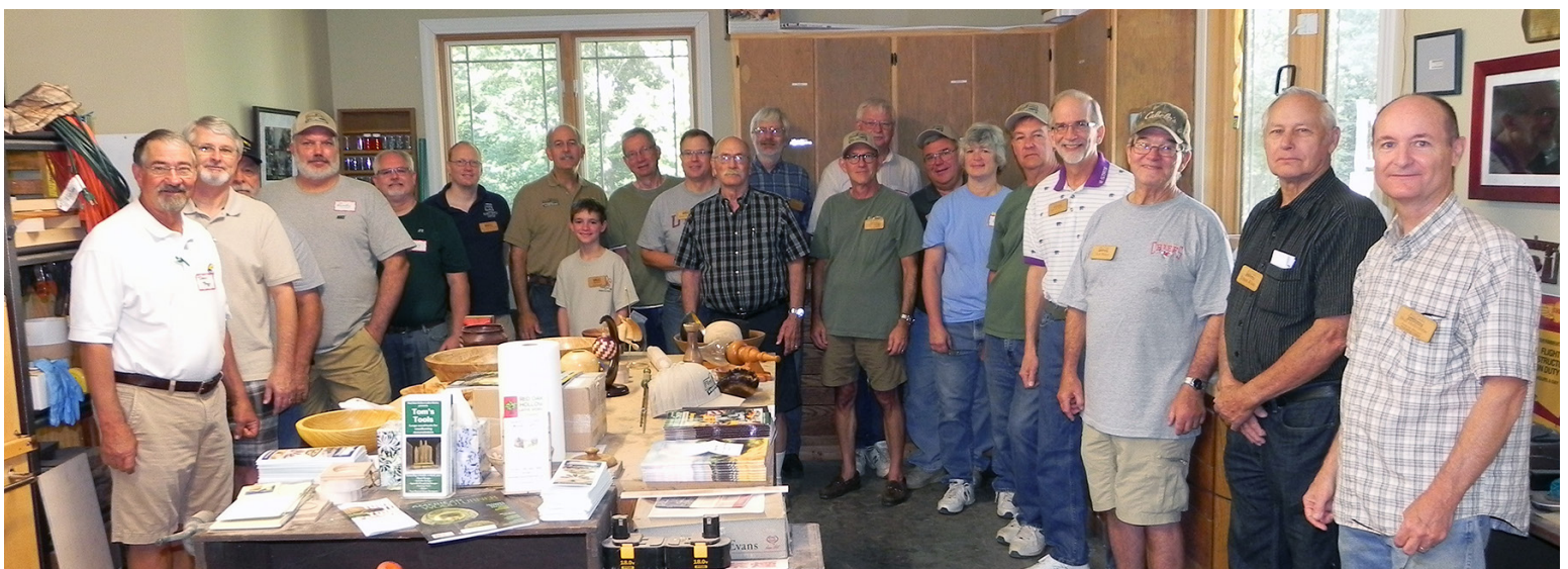
Flint Hills Woodturners, September, 2015