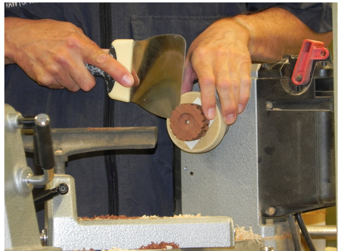
A scraper makes removal easier.