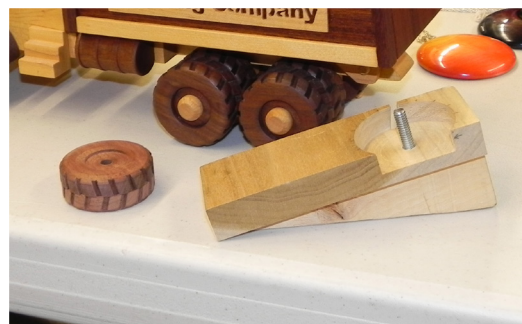
David's jig and sanding platform used to make wheels perfectly round.