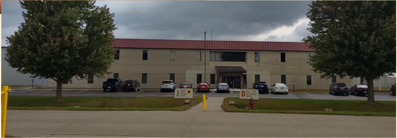
Army National Guard Armory, 721 Levee Dr, Manhattan, KS 66502