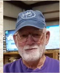
By: Vaughn Graber