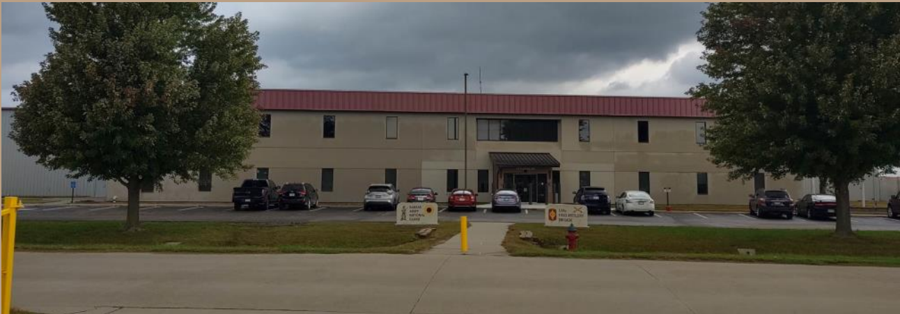
Army National Guard Armory, 721 Levee Dr, Manhattan, KS 66502