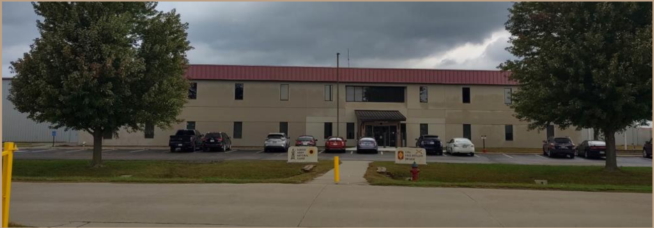
Army National Guard Armory, 721 Levee Dr, Manhattan, KS 66502