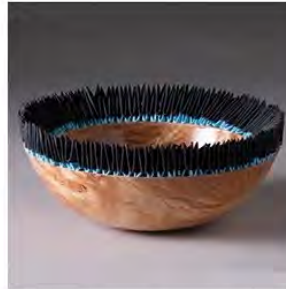
Karlyn Theobald, Pine Bluffs, WY: A Touch of Blue (Youth)